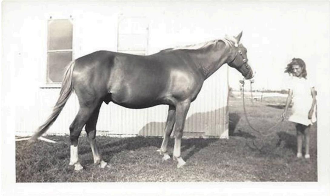
On the farm